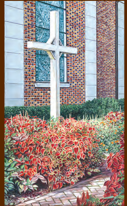
Garden Cross ©2009, by Janet Hauser

Opposite page: A preschool child harvests potatoes from a garden off Park Avenue. This page: (Top) An FBC weekday girl plants pansies. Photos by Len Morrow (Right) Children with homegrown gourds. Photo by Nancy Neale